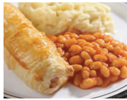
Homemade Sausage Roll served with Mashed Potato & Baked Beans