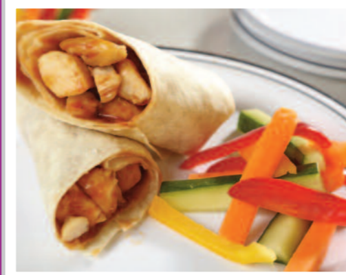
Hot BBQ Chicken Wrap served with Vegetable Sticks or Seasonal Vegetables