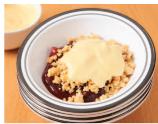
Fruit Crumble & Custard