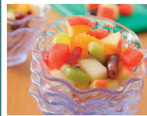
Fresh Fruit Salad