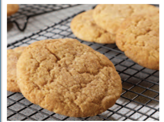
Snicker Doodle Biscuit

Available every day – Unlimited Salad, Freshly Baked Bread, Fruit Yoghurt, Fresh Fruit Platter & Chilled Water. For allergen information, please ask one of our Catering Team. All the above dishes are subject to availability.