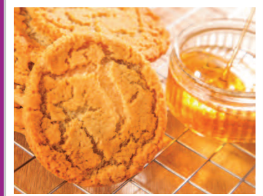
Golden Crunch Cookie

Available every day – Unlimited Salad, Freshly Baked Bread, Fruit Yoghurt, Fresh Fruit Platter & Chilled Water. For allergen information, please ask one of our Catering Team. All the above dishes are subject to availability.