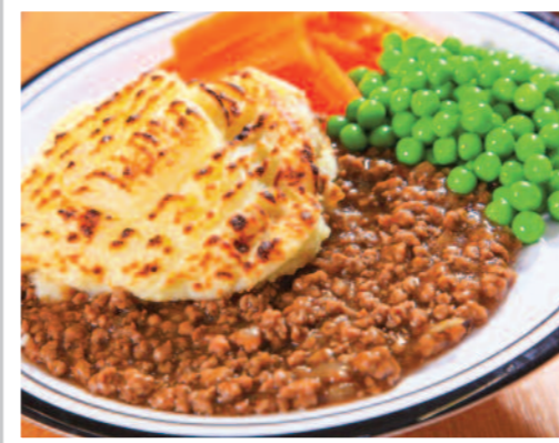
Cottage Pie served with Seasonal Vegetables