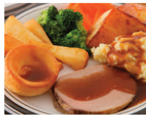
Roast of the Day served with Roast/Mashed Potatoes, Seasonal Vegetables & Gravy