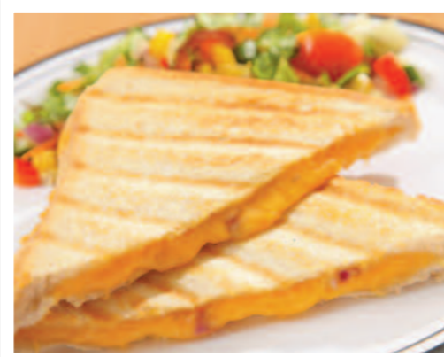
Daily Hot Deli Choice Served with a Side Salad