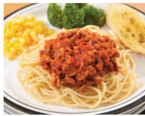
Spaghetti Bolognese (V) served with Garlic Bread & Seasonal Vegetables