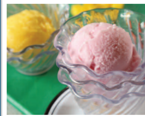
Frozen Fruit Yoghurt