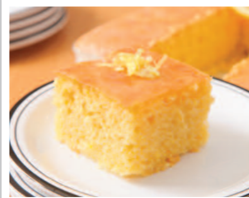
Lemon Drizzle Cake