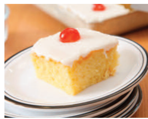
Iced Sponge Cake