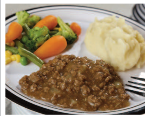
Mince Beef & Mashed Potatoes served with Seasonal Vegetables