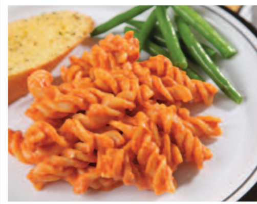
Tomato & Mascarpone Pasta served with Garlic Bread & Seasonal Vegetables