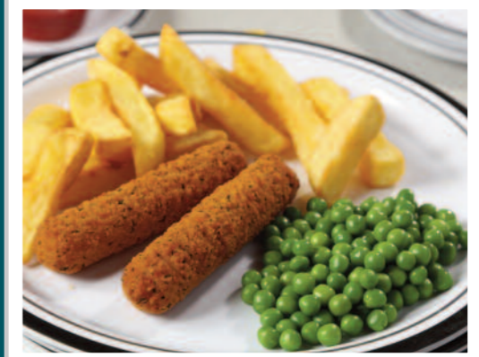
Breaded Mozzarella Sticks served with Chips & Peas or Baked Beans