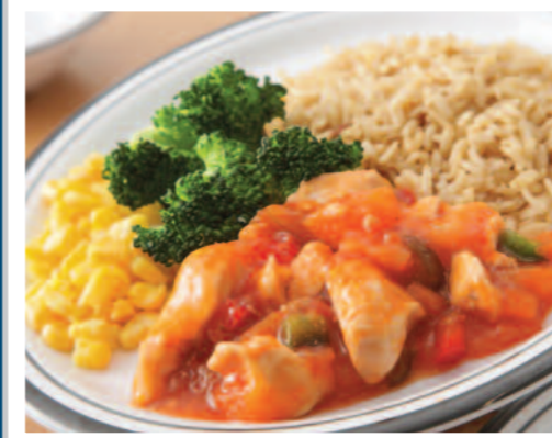
Sweet & Sour Chicken served with Rice & Seasonal Vegetables