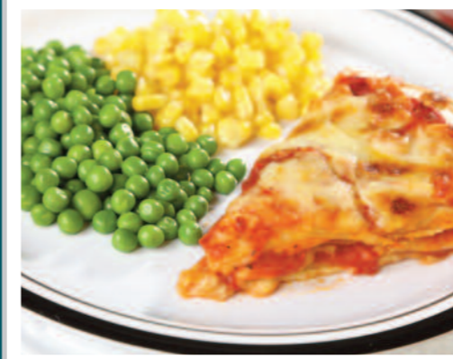
Cheese & Bean Stack served with Vegetable Sticks or Seasonal Vegetables