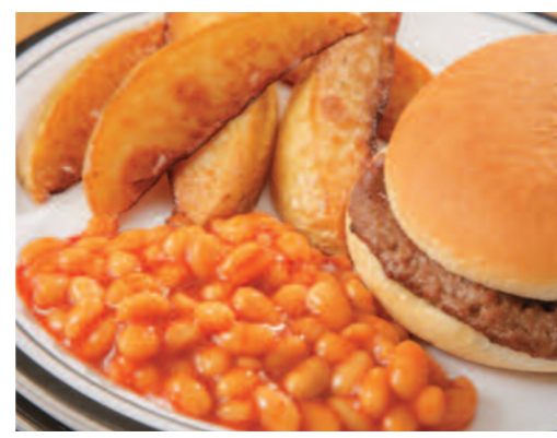
Beef Burger served in a Bun with Potato Wedges & Seasonal Vegetables or Baked Beans