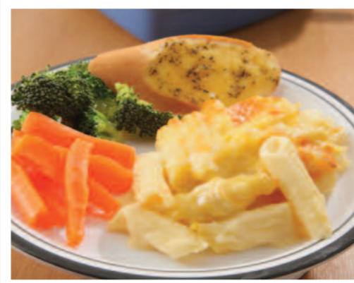
Mac'n'Cheese served with Crusty Bread & Seasonal Vegetables