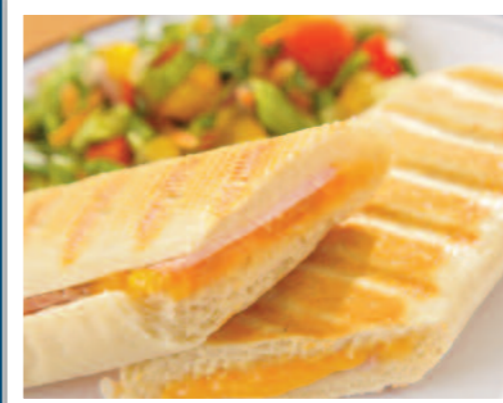
Daily Hot Deli Choice Served with a Side Salad