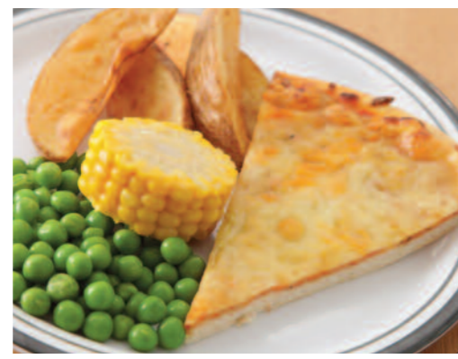
Cheese & Tomato Pizza served with Potato Wedges & or Seasonal Vegetables